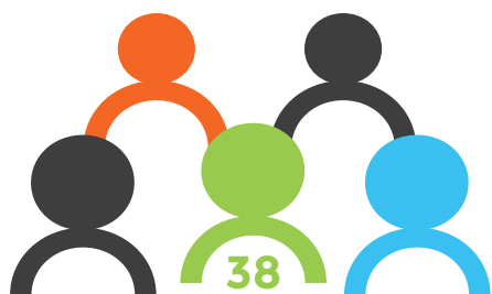
MEMBERS across all projects